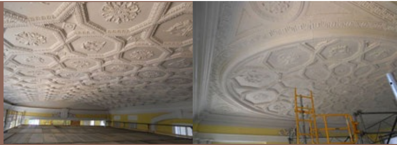
"Garrett Hall at UVA"

Making a recurring donation is the easiest way to give and ensure your favorite projects receive ongoing