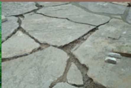
"Repair work in progress"